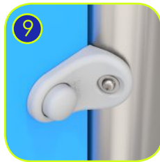
Plate and rope connectors made of injection molded polyamide.

Safe pipe plugs made of injection molded polyamide.